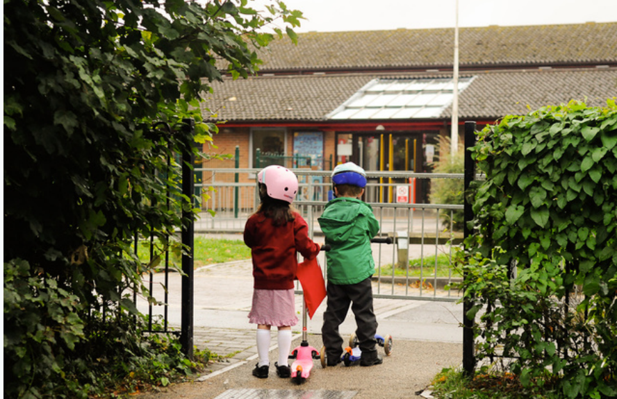
Welcome 'Inspiring and Growing for Fullness of Life'

At St. James' this statement really matters and is fundamental to our vision of the journey that pupils take at our school. Our children are all individual and unique; they have all been and are going on a different journey but our mission is to ensure that we develop the whole child, designing a curriculum that enables them to 'live life to the fullest'.