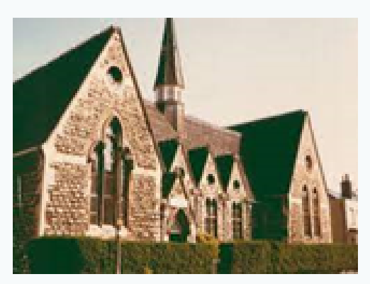
We have certainly moved on since then....

St. James' C of E Primary School was opened in 1865 in Great Norwood Street. It was, in fact, 'three schools in one' – a boy's school, a girls' school and an infants' school. The teaching was restricted to the '3 Rs' and Scripture: the children would have to learn the catechism, the chapters of the Bible and would have had to pass the annual examination.